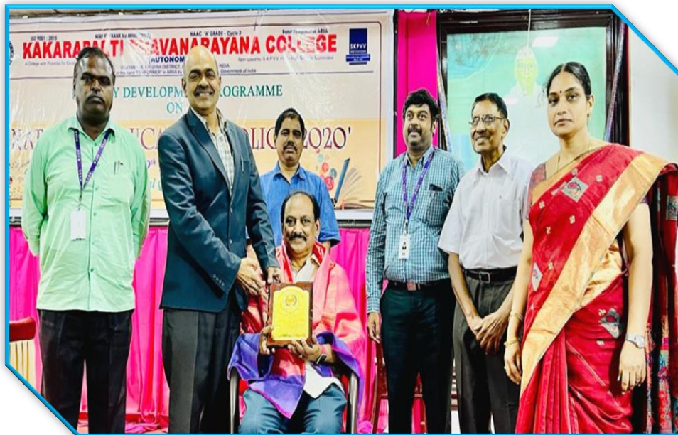
Felicitation to the Resource Person by the dignitaries